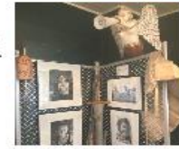
Detail of the Watermen's exhibit at the Colonial Beach Museum.

The Museum at Colonial Beach chronicles the town's history with permanent and changing exhibits. There have been displays of recovered artifacts documenting a Native American presence dating to 500 B.C., long before John Smith visited the area during his voyage of discovery in 1608.