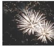
The Town of Colonial Beach hosts a spectacular fireworks display on July 4th attended by upwards of 10,000 people.