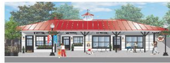
We envision a deteriorating old garage charmingly renovated into a replica of its former self to house interesting shops or a gallery (above).