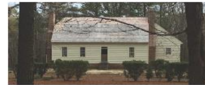
President James Monroe Birthplace

The area is also notable for the Lee Family ancestral home, Stratford Hall. While Robert E. Lee was born here, one of his ancestors built this magnificent plantation house that is a restoration of the original, not a replica. What is little known is that other ancestors who lived there played a crucial role in spurring and waging America's fight for independence. Tours also highlight the lives and contributions of the enslaved and indentured people who made the bricks and built the Great House, as well as the lives of women in the Lee family.