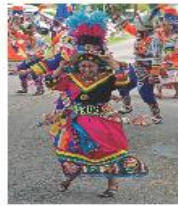
Bolivian dancers are a highlight of the Riverfest Parade that kicks off the summer season.