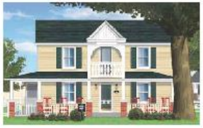
As in bygone eras, large old homes are making space for today's visitors, such as the Center House pictured above reputed to be the town's oldest building. It's expected to become a B&B.