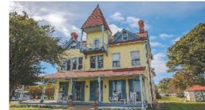
The Bell House