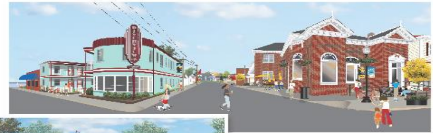
With a creative “adaptive reuse,” the distinctive Westmoreland Bank Building (above) could become a showpiece in the downtown.