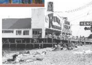
Historic picture of the Reno Casino during gambling's heyday mid-century.

In the late 19th and early 20th century, Colonial Beach flourished as a popular riverside resort with steamboats bringing in tourists from Washington, DC and Baltimore. The town experienced a resurgence mid-twentieth century and earned the moniker, the "Little Las Vegas," when a quirk in MD law temporarily legalized gambling on the waterfront for nearly a decade.