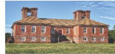
The Stratford Hall Great House

Westmoreland County, VA has been called the birthplace of the nation. Within 16 miles of Colonial Beach are the birthplaces of three presidents, more than anywhere else in the United States. Faithful replicas of the Washington and Monroe homes have been constructed, with Washington's home open for tours much of the week year-round. The grounds of the ancestral Monroe Plantation are likewise open year-round, while the home and Visitor's Center are currently open summer weekends. On the foundation of the 1670s plantation where Madison was born is the exquisitely restored and fascinating Belle Grove Plantation built in 1791 and now a bed and breakfast.