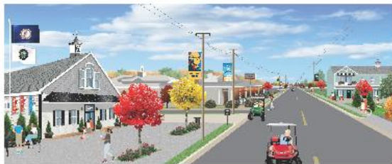
Meeting community needs is another way to build year-round foot traffic in our commercial district. To the left, a new municipal center has been proposed for a large, empty warehouse near the entrance to town. Further down, a rental development with units for workforce housing could be built on or replace what is now a vacant motel.