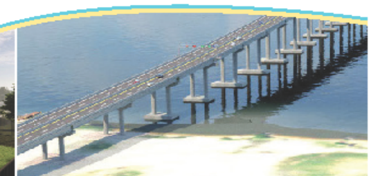
New Governor Harry W. Nice Memorial Bridge