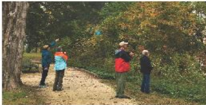
Birdwatchers on a trail at George Washington's birthplace, considered a premiere site on the Northern Neck for birding observation.