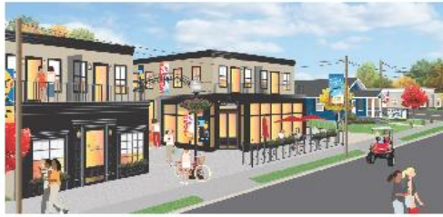
The graceful arch in the new development (above) references the Town Pier's artistic gateway. Reinterpreting historic features in novel ways links new construction to the past.