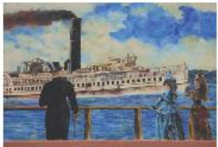
Steamboat mural Steamboat era in Colonial Beach during the late nineteenth and early twentieth century depicted on one of the downtown's many murals.

Colonial Beach offers all that and more. It's a historic beach town on the Potomac River, a port-of-call for recreational boaters and watermen, a golf cart community, art and music haven, foodie destination, bird sanctuary, and base camp for exploring notable Colonial and early American sites nearby.