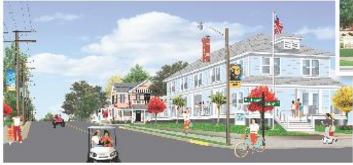
Restorations on eastern Colonial Avenue are already underway such as this former fraternal lodge (left) that presents a number of commercial possibilities. Historic tax credits could cut renovation costs nearly in half for the shop next door (above). Second story rental could further off-set costs.