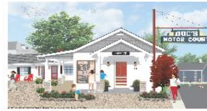
We celebrate the historic renovations of our mid-century motels. A local icon, Doc's Motor Court built in 1948, is slated for a historic renovation. The “Retro” restoration of the Riverview Inn (below), awakened interest and confidence in the downtown's potential.

Downtown Colonial Beach, the community's Main Street Affiliate, initiated an effort to “envision” a downtown that would be beautiful and vibrant reflecting residents' pride and joie de vivre about living in Colonial Beach, preserve its historic, small town character, and respond to community needs reflected in the town's Comprehensive Plans (2009 and 2021 draft) and other surveys. A grant awarded by the Department of Housing and Community Development (DHCD) enabled us to translate these thoughts and sentiments into renderings to inspire and guide the new investors and businesses we hope to attract to help us realize this vision in our downtown and commercial core. Realistically, we don't believe that an infusion of additional retail stores and restaurants would in and of themselves become a year-round tourist draw. But when combined with other attractions like the beach, boating, fishing, historic sites, hiking and naturalist activities that build upon each other, together they add up to an appealing package that is more than the sum of its parts.