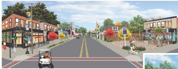
Empty lots present opportunities for building new developments that complement the old. Rental over retail improves financial viability (left).