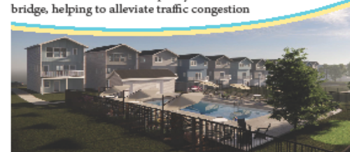
New Townhome Development

A nomination to name the Northern Neck a National Heritage Area has been presented to Congress. Designation will showcase the rich history of the Northern Neck. Colonial Beach is the natural entry point and base camp for exploring the area.