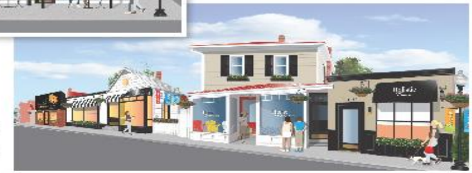
Hawthorn St. (right) with its inviting shops, gallery, restaurant, museum and playhouse could play a starring role in the downtown revitalization.